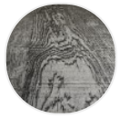
Carbonised wood X094