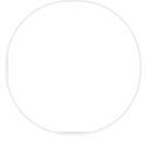
Solid surface white 3mm X035