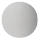
reconstructed stone X084