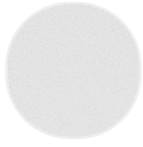
Matt painted white X053