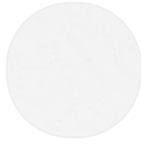
Gloss painted white X060