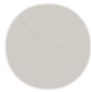
Reconstructed stone white Calce X131