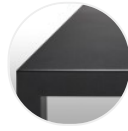
Goffered matt painted black iron X130