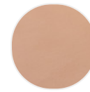
Reconstructed stone pink onyx X134