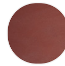
Reconstructed stone brick red X160 NEW!