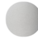
Reconstructed stone Serena X084