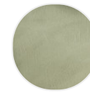
Reconstructed stone sage green X161 NEW!