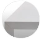
Goffered matt painted white X124