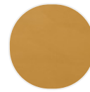
Reconstructed stone yellow onyx X133